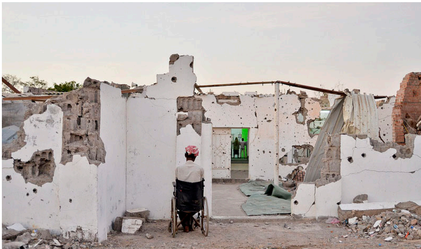
This man in a wheelchair recently returned to Al Kawd. He says his prayers in a badly damaged mosque.